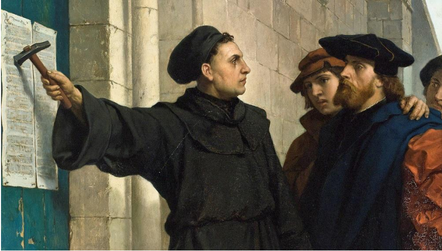
Martin Luther 1483-1546