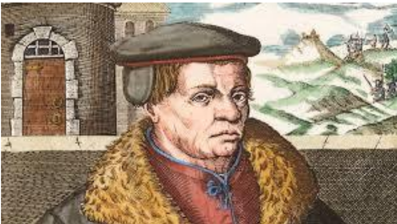
Thomas Müntzer 1489-1525